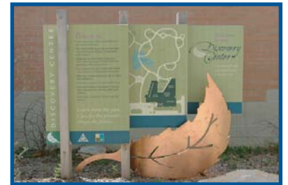
The Discovery Center provides numerous conservation education opportunities.