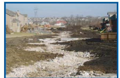
Construction of the stream channel and trail system.