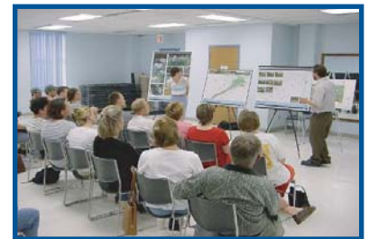
Stream and trail design and native plantings are presented at a community meeting.