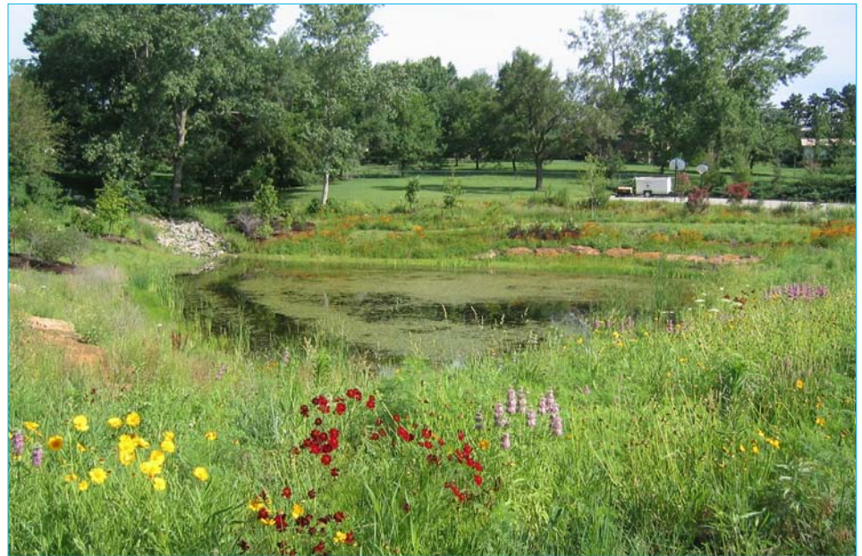
Wet pond at St Pauls United Methodist Church in Lenexa, Kansas

Several Kansas and Missouri communities have adopted the manual along with other watershed management practices. See the table at the end of the report for a summary.