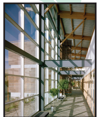
Natural light creates a comfortable, healthy environment for employees.