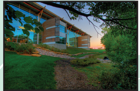
The outside of the Sunset Building with natural water features.

Johnson County Government 111 S. Cherry St. Olathe, KS 66061 (913) 715-1146