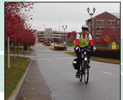
Bikes are provided for employee use for transportation to meetings or to ride during breaks.