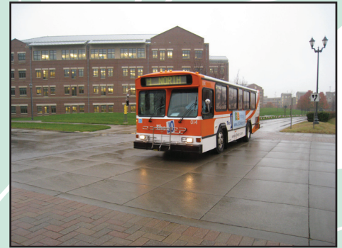
Employees were encouraged to take advantage of the metro system as part of the program.

Hank King 6100 Sprint Parkway Overland Park, Kan. 66251 913-315-4908