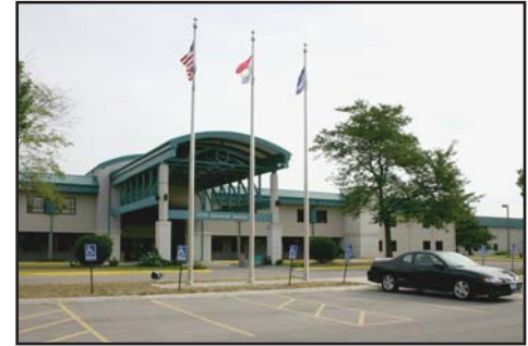
BTC West Lobby entrance, south parking lot

The Mid-America Regional Council will be renovating its offices and the building owner will be adding on to the parking structure. Starting Oct. 1 many MARC meetings will be held at the BTC location due to construction at Rivergate Center. We appreciate your patience as we renovate the MARC offices and parking.