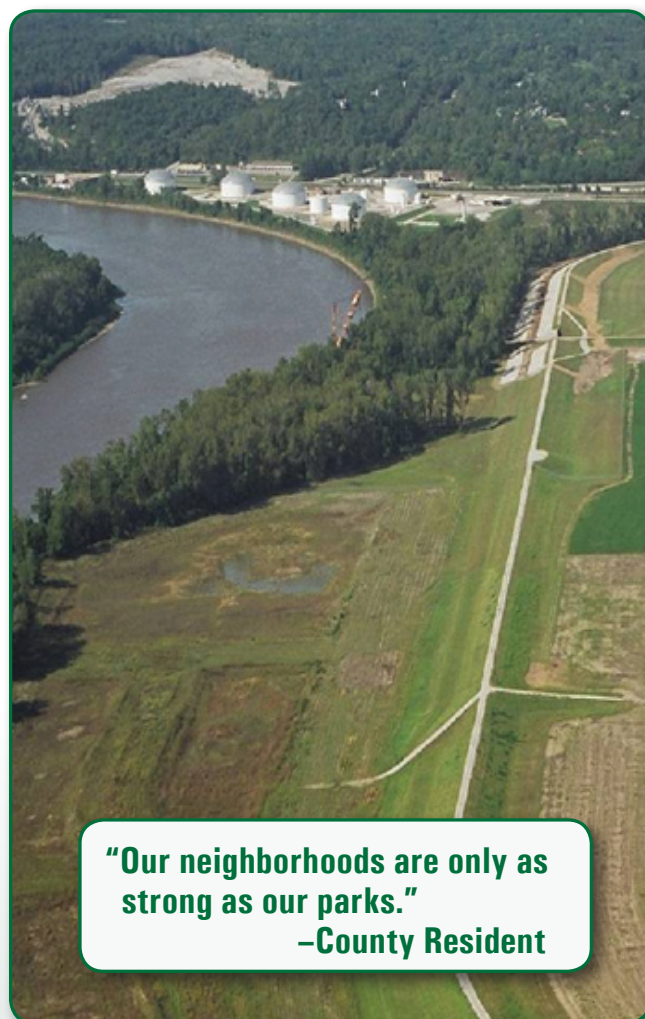
The Missouri Riverfront Trail runs atop the levee

For more information, including the complete Park System Master Plan report, visit: www.platteparks.com