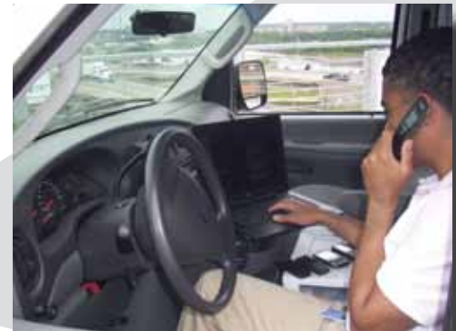
MARC public safety communications technicians make test 9-1-1 calls from each location using phones from six different wireless providers.

MARC's goal is to annually test 30 percent of the more than 5,300 wireless cell sectors in the region. Public safety communications technicians place test calls using cell phones from each of the six major wireless carriers (AT&T, Cricket, Nextel, Sprint, T-Mobile and Verizon) in the region. To date, communications technicians have tested all cell sectors in Kansas City, Mo., and will continue conducting wireless accuracy testing focusing on the Kansas side of the region.