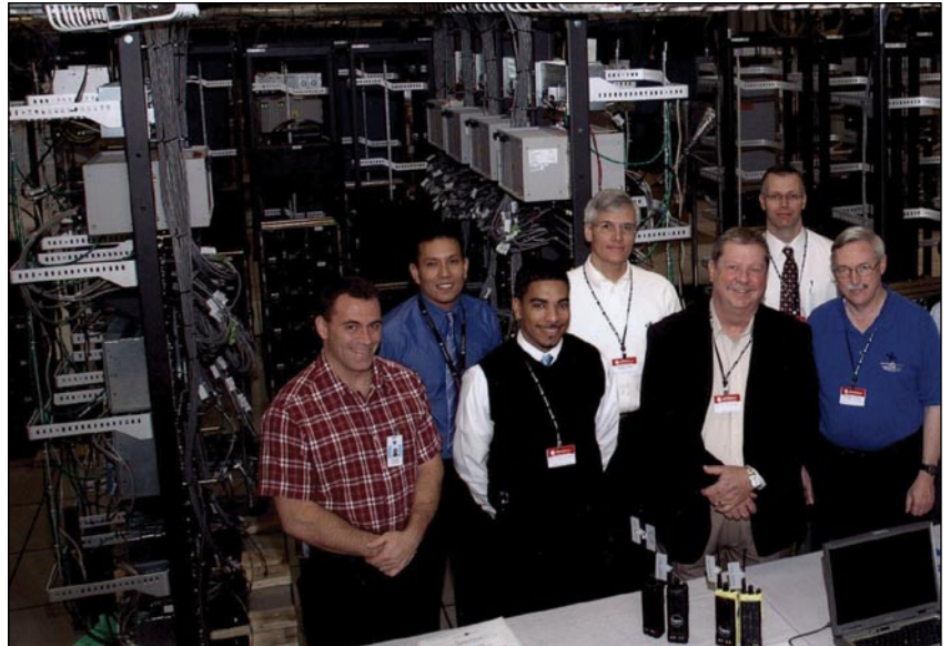
Members of the project team — local officials, MARC staff and representatives from Motorola — tested equipment before installation began at the RAMBIS tower sites.

The design of the high-speed microwave backbone that sends signals from tower to tower is nearly complete, and this equipment will be ordered and installed soon. Most of the RAMBIS system should be operational by the end of this year.