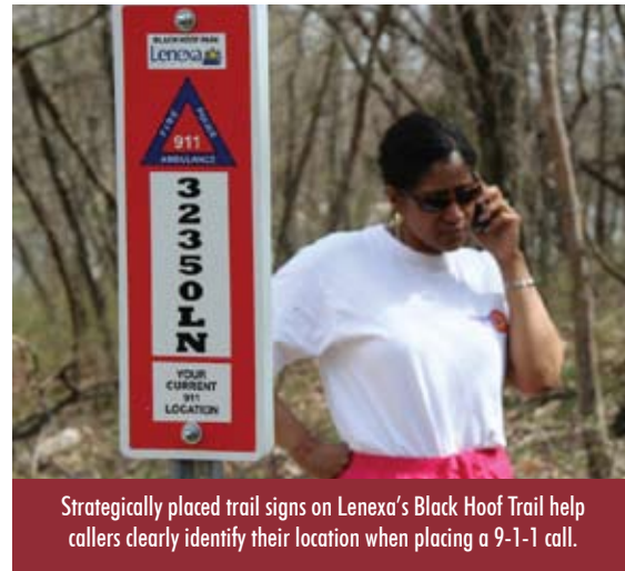
Strategically placed trail signs on Lenexa's Black Hoof Trail help callers clearly identify their location when placing a 9-1-1 call.

The mapping of Black Hoof trail was a multi-step process that included gathering trail data, completing a wireless cell study, determining sign placement locations and mapping those locations. Each sign cost approximately $74 which includes hardware, software and labor. A group of Boy Scouts working towards Eagle Scout honors helped install