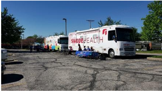
Mobile Units in Action