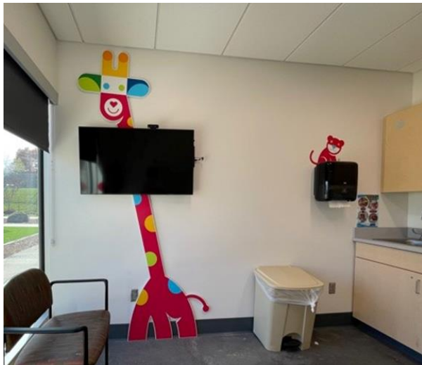
Psychiatric Telehealth Service Room