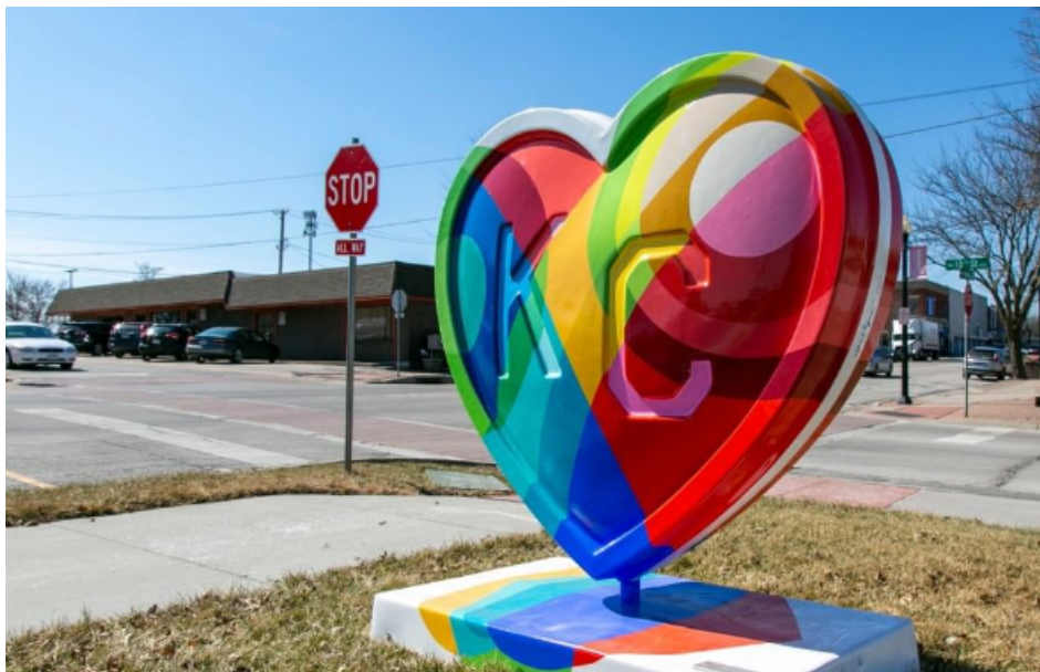
"Connected Heart" by Shelly Pinto displayed at 10th & Main in Blue Springs

These on-scene interventions help connect people in crisis with mental health services and prevent unnecessary arrests, emergency room visits and future police calls for service. ReDiscover recently identified additional funds to expand the program in Grandview and Raytown. The current federal grant expires in 2023, and the partnership is working to pursue future sources of funding to sustain and expand the program.