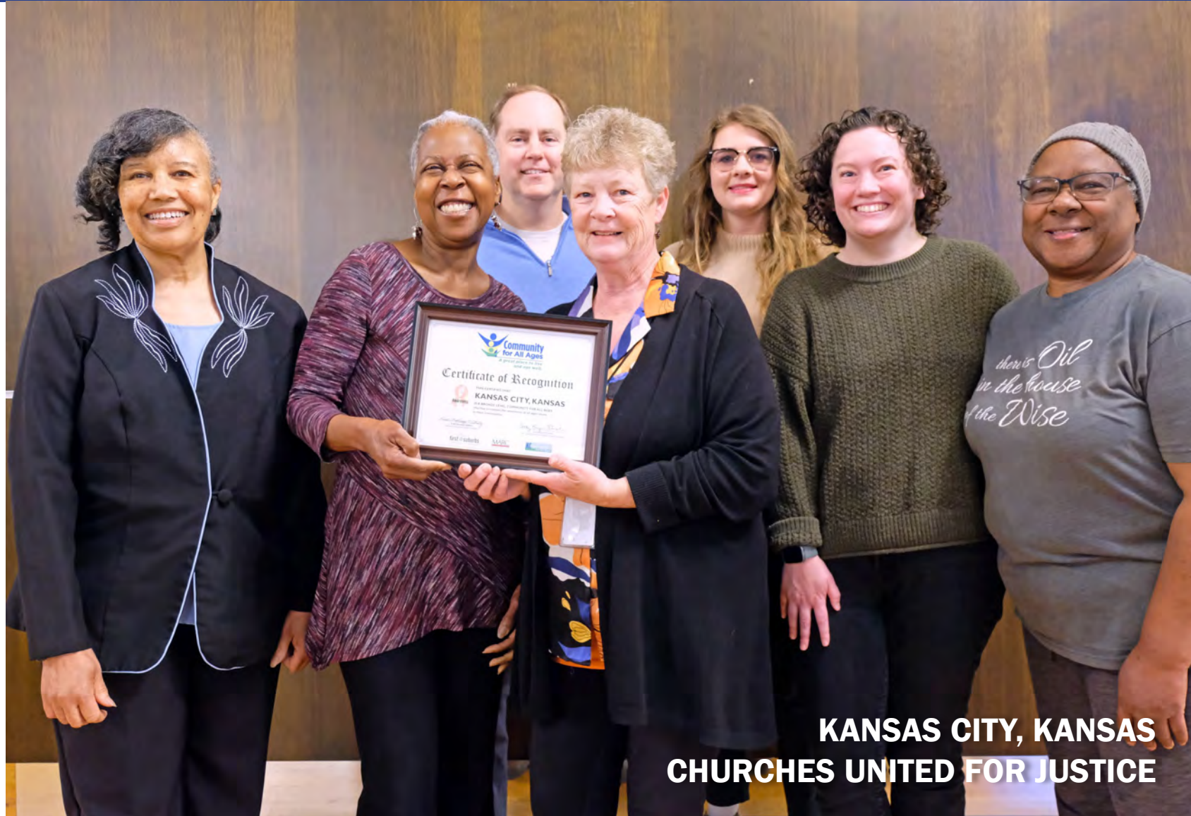
KANSAS CITY, KANSAS CHURCHES UNITED FOR JUSTICE

provides education, technical assistance and recognition to cities and counties in the region that take meaningful steps to become more inclusive of residents of all ages and, in the process, more vibrant, healthy and prosperous