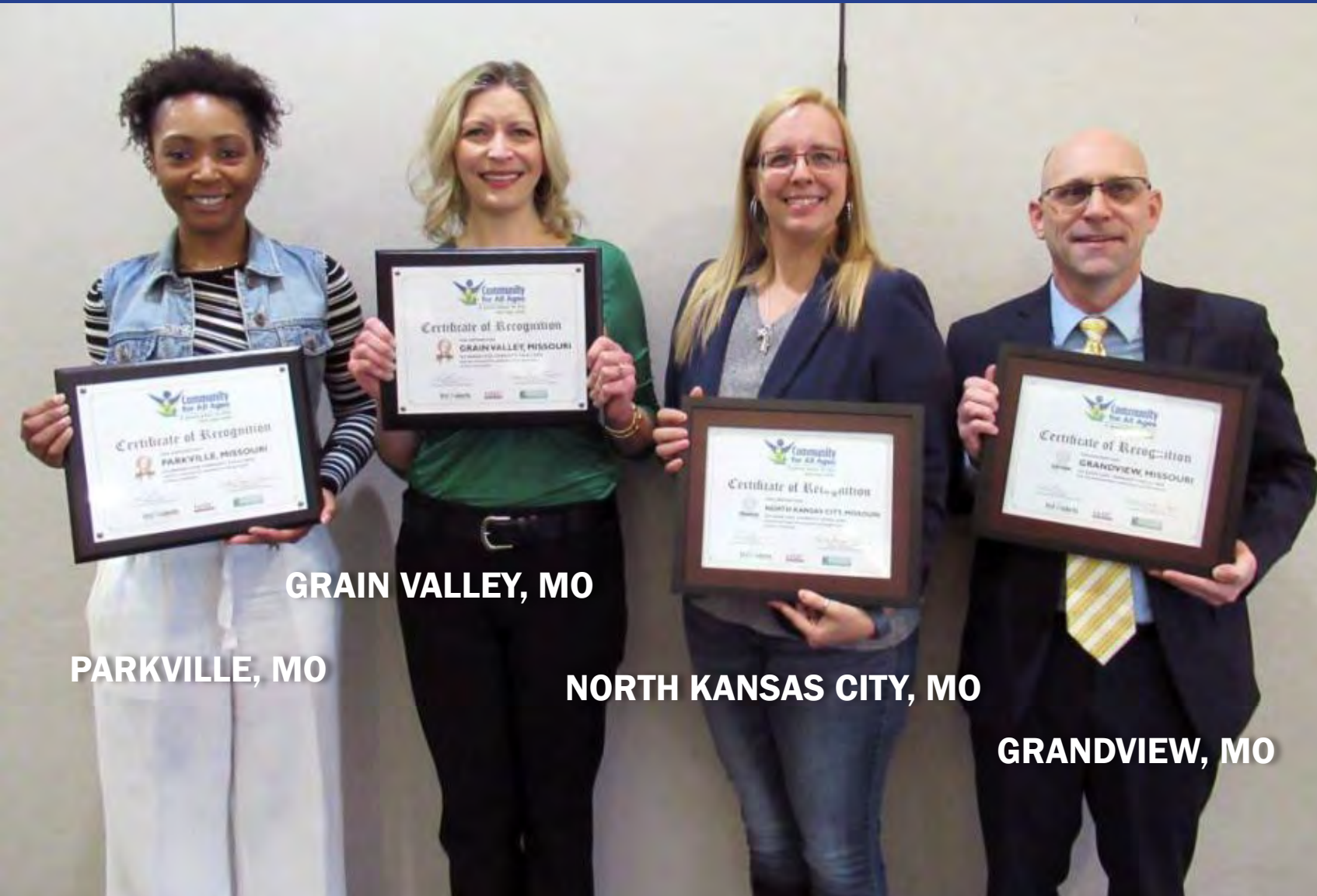
GRAIN VALLEY, MO