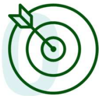
Collaboration & Leadership