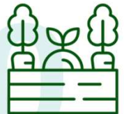
Food & Agriculture