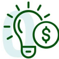
Innovation & Finance