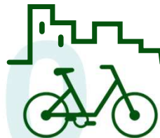
Transportation & Land Use