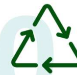
Circular Economy & Waste