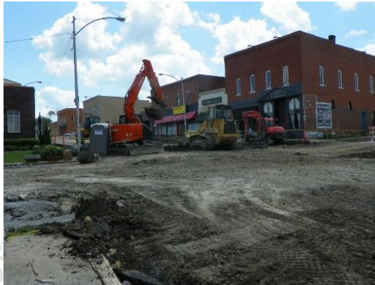
Construction 26 Projects