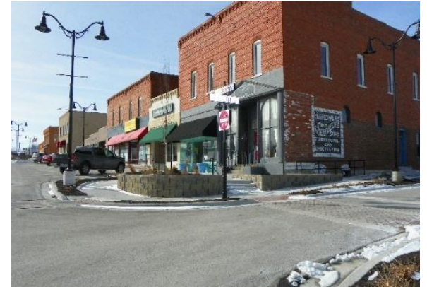
Completed 100 Projects